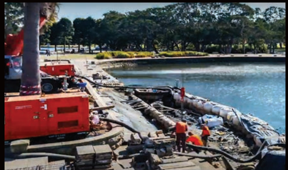
2019 – Finalist for project up to $2M Duck Pond Retaining Wall Remediation Works, Centennial Parklands