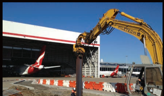
2013 – Finalist for project up to $2M QantasLink Relocation Works, Qantas Jet Base, Mascot