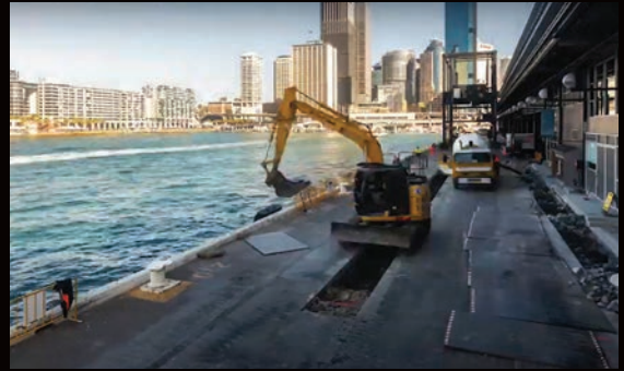
2019 – Finalist for project between $2M - $5M Gangway Enabling Works, Overseas Passenger Terminal, The Rocks