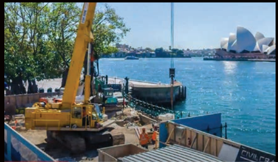
2017 – Finalist for project up to $2M New Southern Mooring Point, Overseas Passenger Terminal, The Rocks